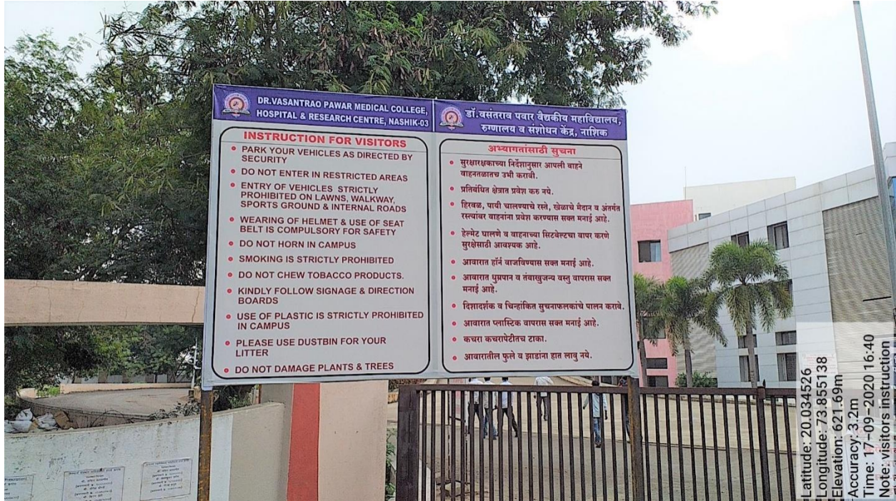
Visitors Instruction board at entrance of campus