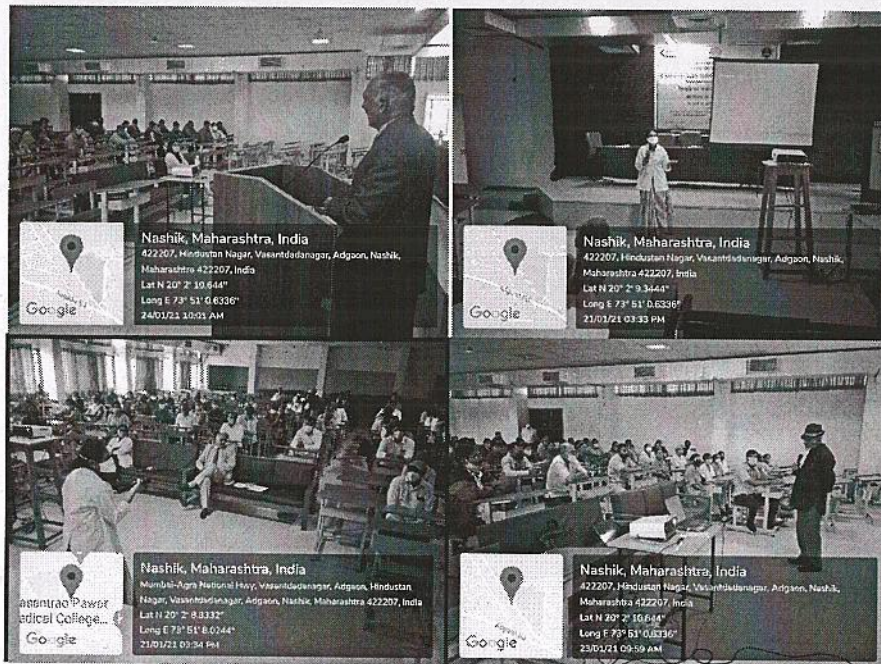
Interaction with Participants by Esteemed Speakers of the Workshop