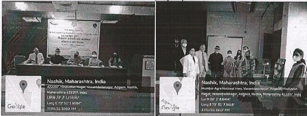
Inauguration ceremony of Workshop on "Working Skills & Behavioral Development"