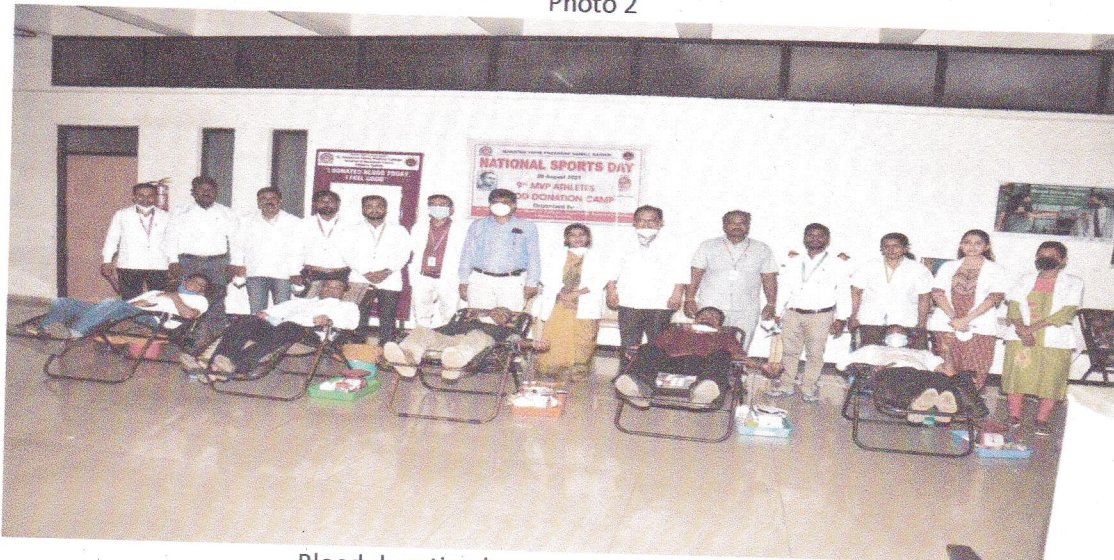
Blood donation by non teaching staff & students