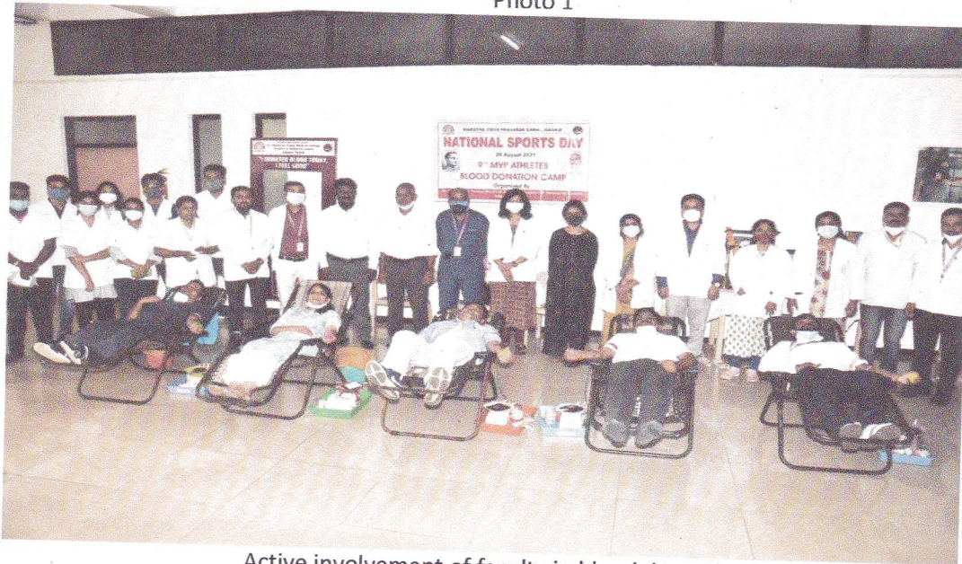
Active involvement of faculty in blood donation drive