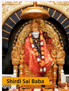
Shirdi Sai Baba