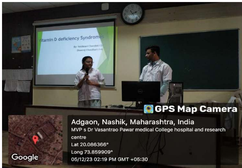
Seminar by students