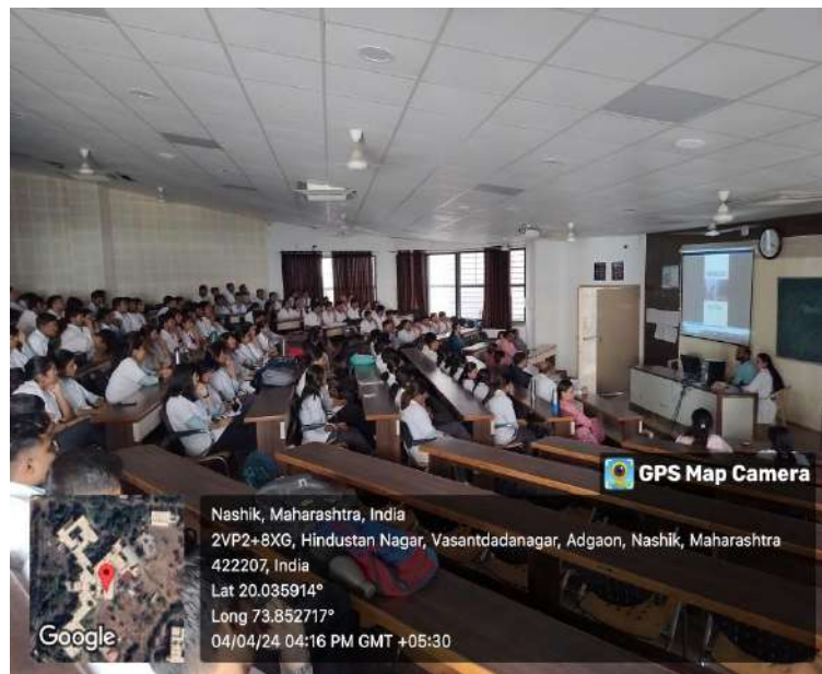
Reel making competition