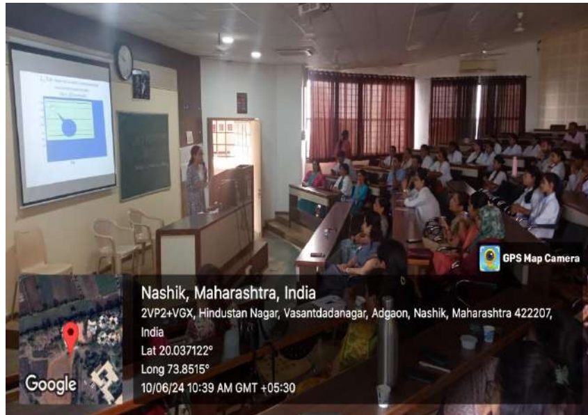
CME on World Accreditation day