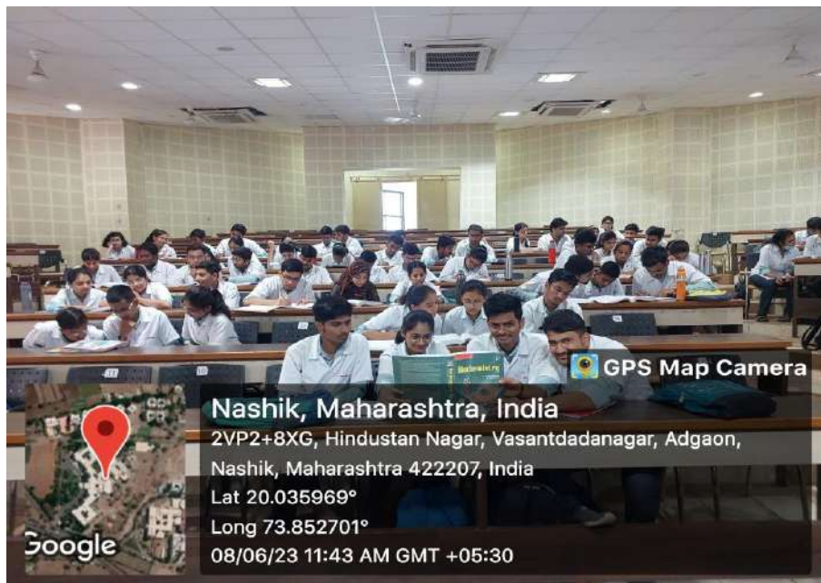
Self- Directed Learning