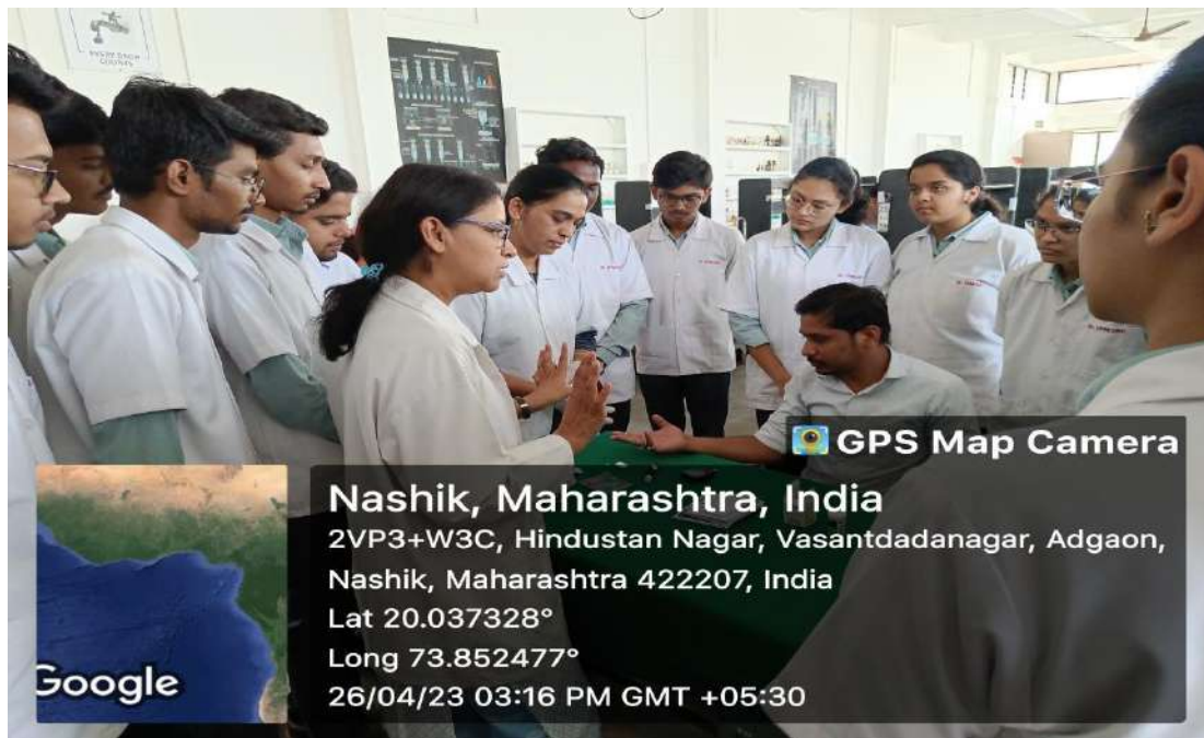
Skill session (DOAP) – capillary blood glucose