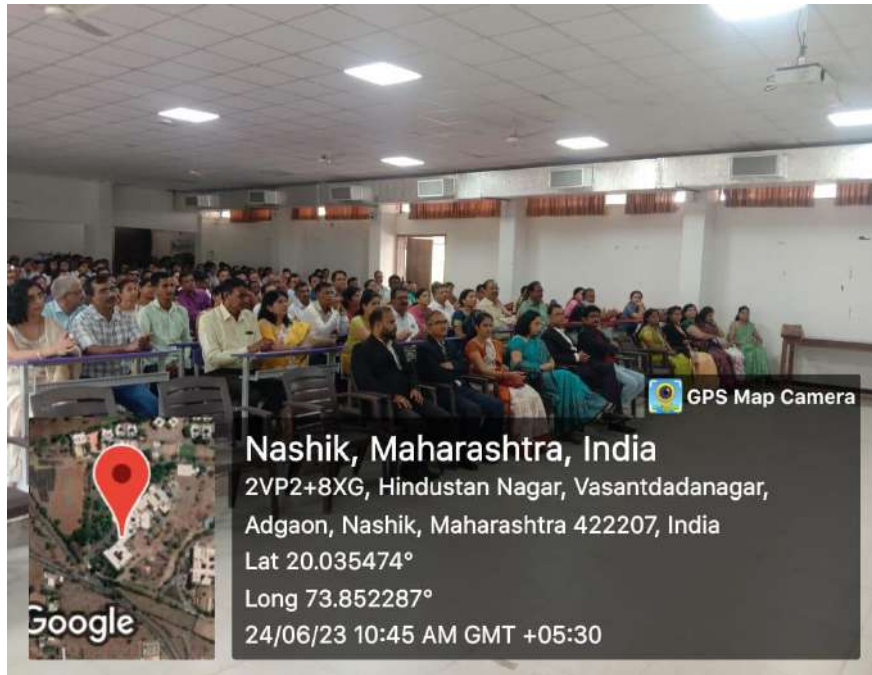
Parent Teacher Meet