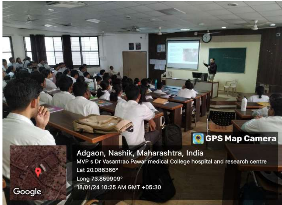
Early Clinical Exposure