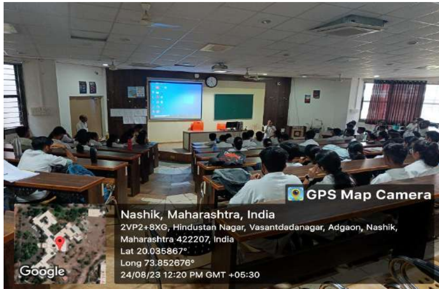
Extra- curricular Activity (Singing/poetry)