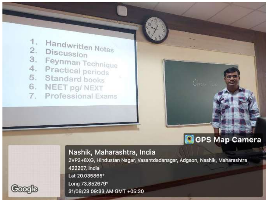
Career guidance by Alumni