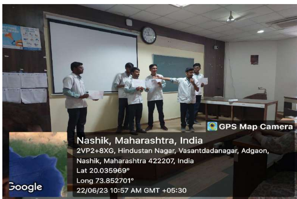
Biochemistry in Role play