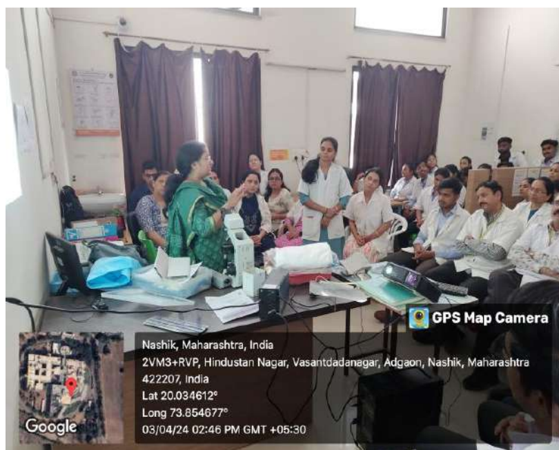
Workshop on lab safety measures