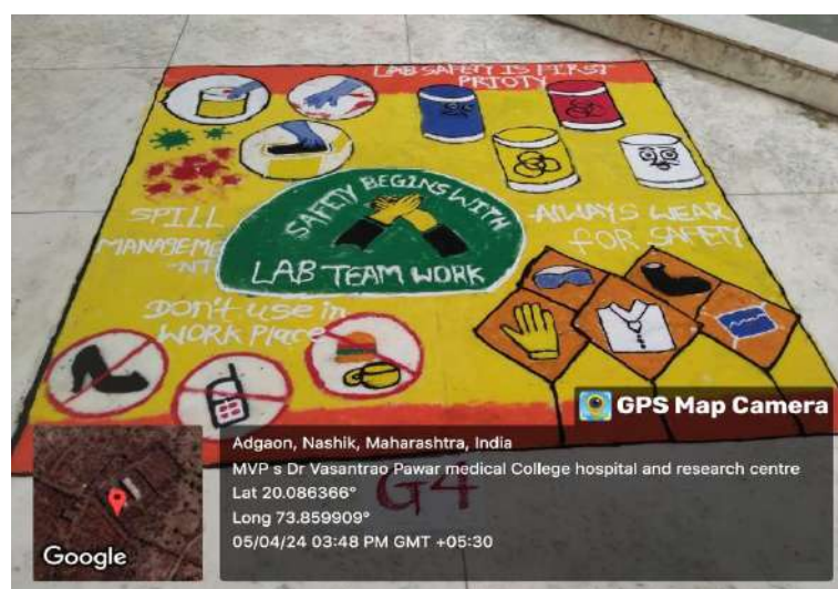
Rangoli competition-Lab safety week